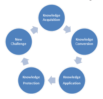
Figure 1: Pictorial representation of knowledge process capabilities

The figure below is a pictorial presentation of process capabilities. Once the process is achieved, the new challenge starts the trigger again and the entire process is repeated. This is done to achieve better organisational performance.