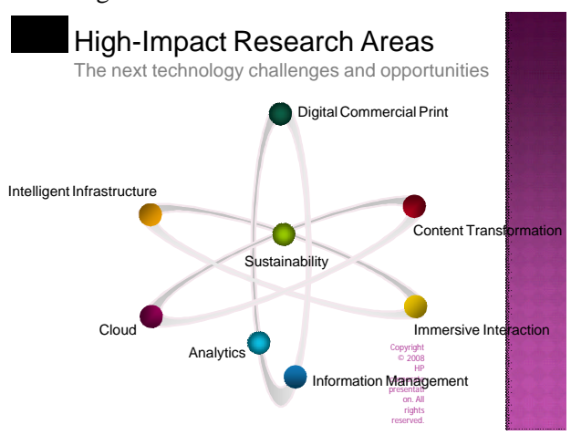
Figure 1: High Impact Research Areas being pursued by HP Labs

HP Labs drive the research at HP which is futuristic and has mid to long term impact. There was a change in leadership at HP Labs in 2007 to bring in a greater focus and channelize the research investments in areas which could result in bigger returns for the organization. These are represented in the figure below: