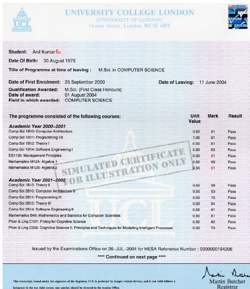
Figure 3: The Output of Verification Showing Possible Alterations in Red

for high-value documents. The hardware token, say in the form of a smart card, demonstrates its link with the original document which carries the public key associated with that token. The token also stores and makes available a printable image of the original document. In conjunction with the above-mentioned techniques, this technique pairs the token unalterably with the document. The uniqueness is in the hardware token now, as against the paper document. The owner of the token can even present the token and a photocopy of the document as proof of his ownership of the original. An important feature of our solution is that the use of the token for verification does not use a network.