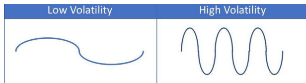
Figure 1: High and low volatility

also economic and social environment and each of these are impacting business (as shown in Figure 1).